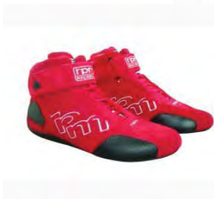
NEW for 2011 Indy 3 Boots $199!