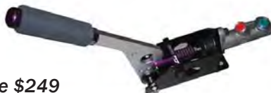
Hydraulic Handbrake $249