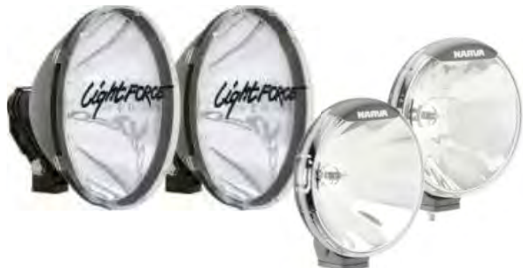
Lightforce Lights from $359 Narva 225's from $350